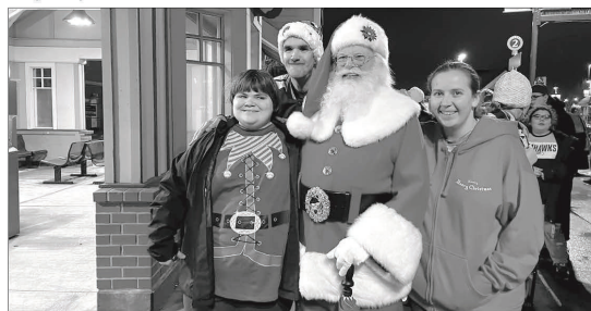
Cover: Santa Sounder Train event guests.

www.piercecountywa.gov/pcsr | 253-798-4199