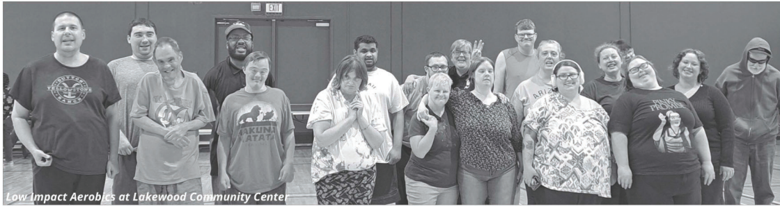
Low Impact Aerobics at Lakewood Community Center