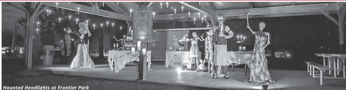
Haunted Headlights at Frontier Park